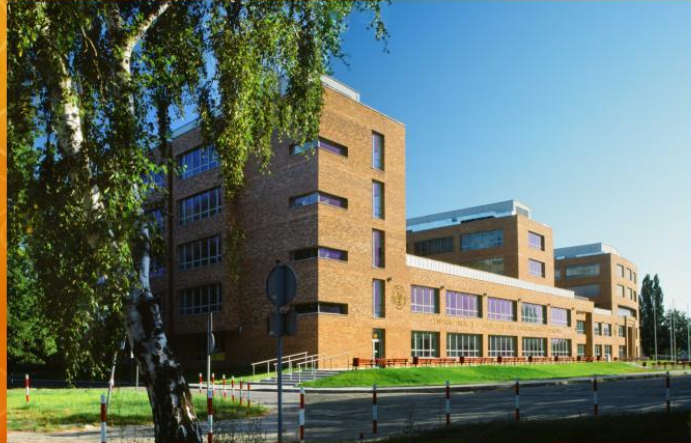
The building no 23 of our Faculty

○ Religions and Postreligions - Contemporary Shapes and Metamorphoses