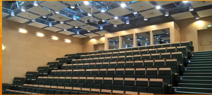
The Robert Schuman's Lecture Hall